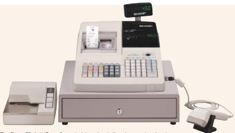
The Sharp ER-A450T, configured with optional slip printer and optional scanner, delivers superior functionality to your business.